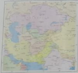
CENTRAL ASIA AND SURROUNDINGS